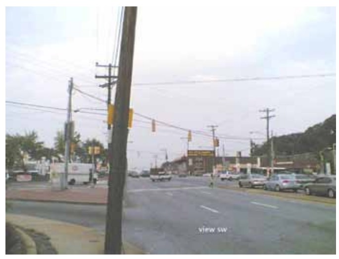
Major Node on New Hampshire Avenue