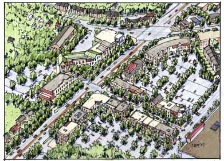
Redevelopment of New Hampshire Ave & East West Highway.