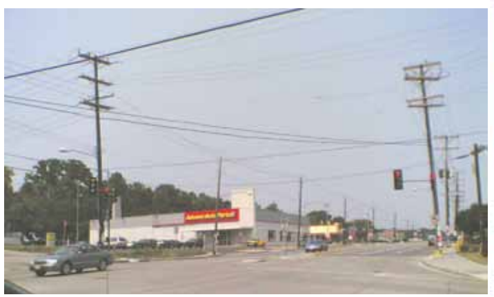
Eastern Gateway before improvement.