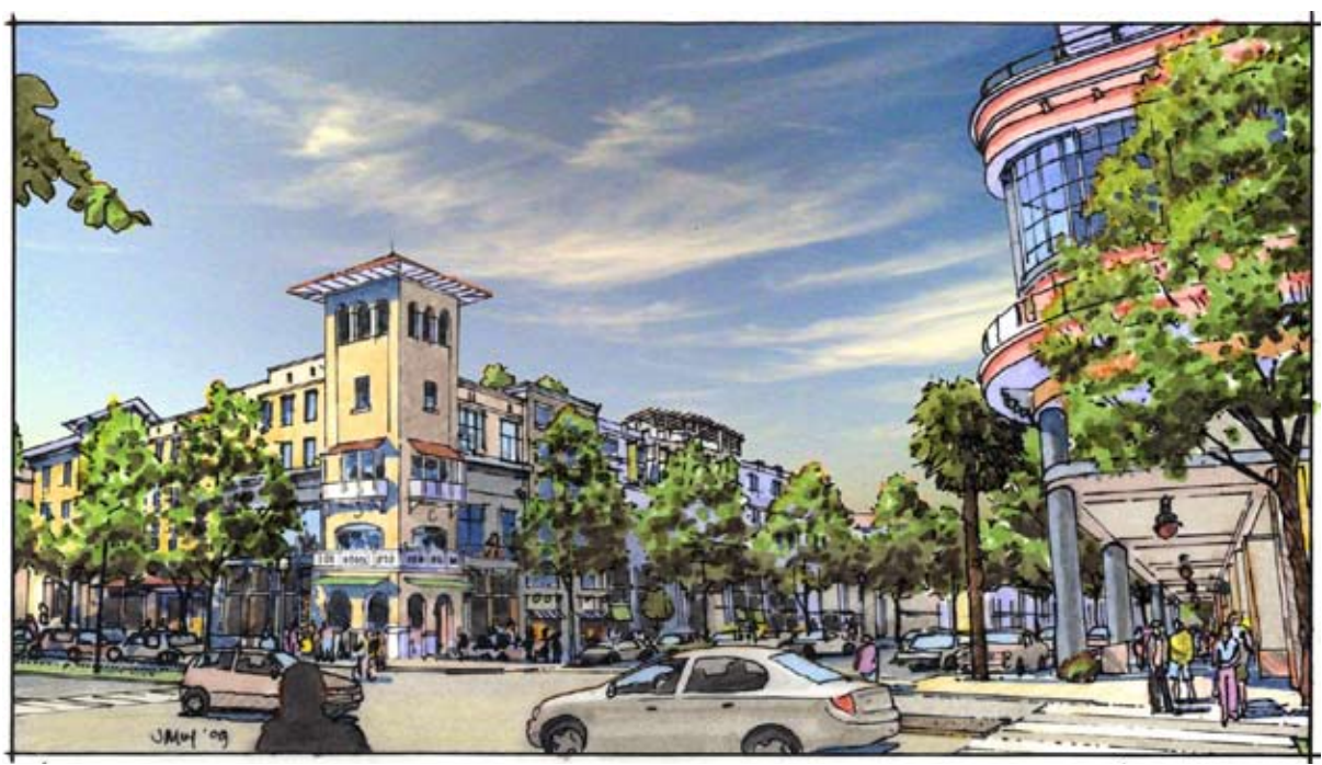
View of prominent intersection on 13th Street.