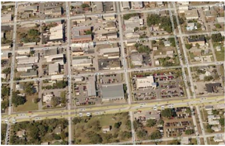
Aerial view of downtown St Cloud. John Moynahan Urban Design & Planning

The downtown development pattern is a rigid 300 by 300-foot grid of blocks and streets containing buildings in varied condition, some of which contribute to Downtown's walkability, and therefore would remain into the future. As a result, physical planning included these contributing buildings, infilling elsewhere as appropriate. Interestingly, St Cloud's prominent open space—Veteran's Park—is located opposite Downtown on the other side of the wide and busy 13th Street. Planning for a calmer, walkable 13th Street as well as formative open space in downtown are key design issues.