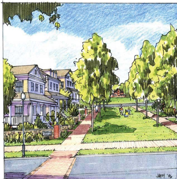
View uphill of mews.

In the tradition of many Pennsylvania towns, the square was used as focal point of the community. Squares are accessed either from its sides or in this case diagonally from its corners. Building walls surrounding the square are between three and fi ve stories. Adjacent the square in the lowest lying part of the site is a pond— formal on one edge and more natural on the other. This amenity displays Freedom Square while doubling as storm water manager.